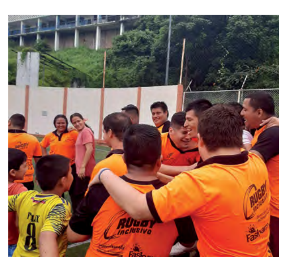
All images: Members of the Jaquars team celebrating their win and enjoying the day's

The Jaguars have set a goal that they will participate in the next tournament with a full team, and represent Ecuador.