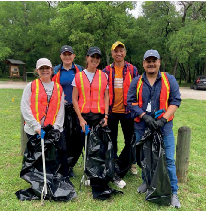
Smurfit Kappa North America: Earth Day clean-up.

Total raised in support of rural producers.