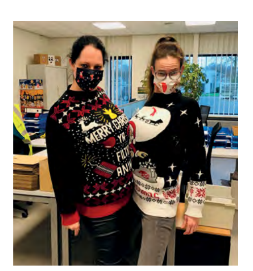
Colleagues in Belgium in their ugly Christmas sweaters.

In collaboration with Medecins SansFrontieres Smurfit Kappa, Spain donated 16,300 boxes filled with urgently needed items including clothing, food and medicine which were brought to the refugee centres receiving Ukrainians.