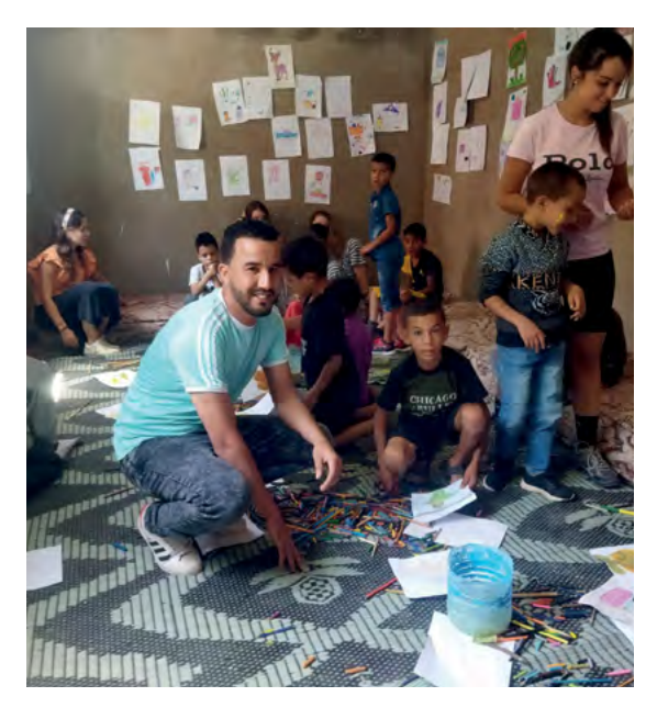
Smurfit Kappa Morocco colleagues with local children from the Atlas mountain region

Our colleagues hosted workshops where the children were taught to paint and participate in fun and educational games.