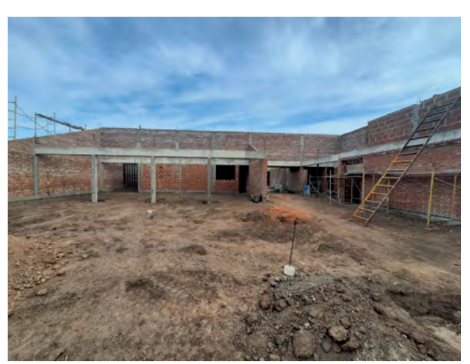
Construction work on the Casita del Niño Rincón del Sol