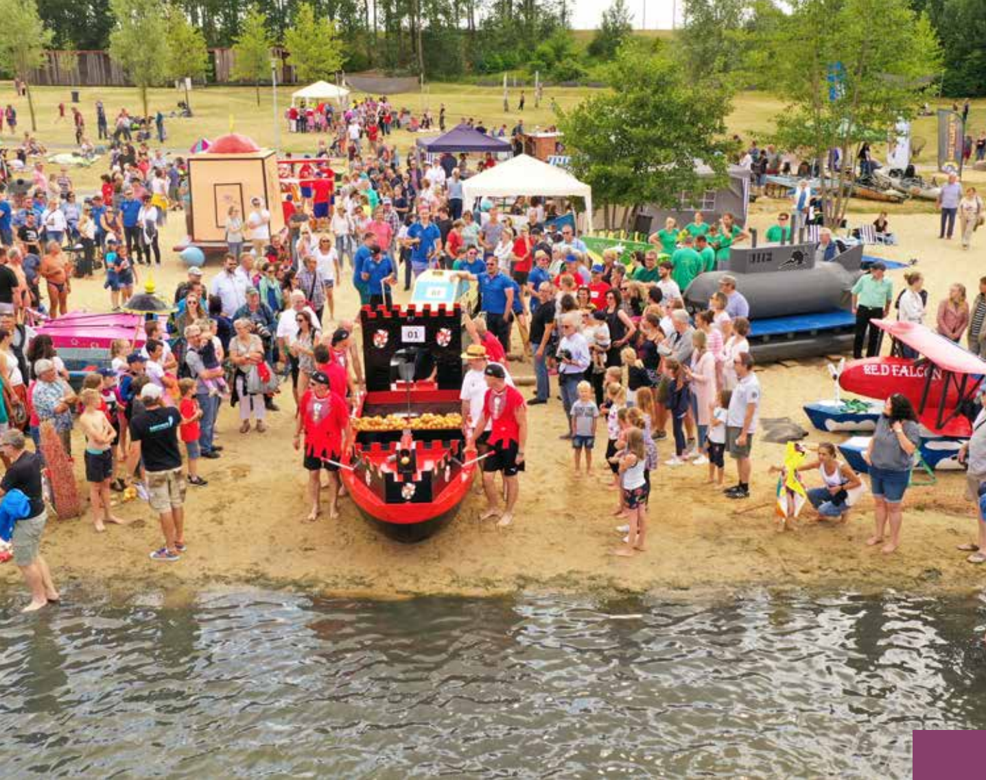
Above: Smurfit Kappa employees showing off their boat-building and racing skills in Germany