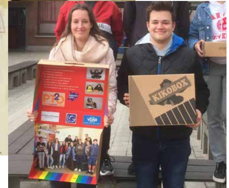
Above: The Kiko box gift for sick children