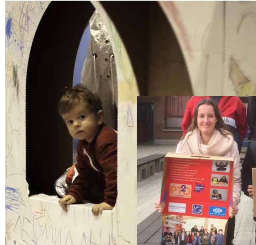
Left: Music and drama for the community at the Smurfit Kappa Theatre in Brazil Above: Heroes and fairy tales in Russia

The Smurfit Kappa Pirapetinga Plant in Brazil was proud to open the doors of the Smurfit Kappa Theatre earlier this year. The launch included a lively and moving programme of music, drama and dance. Almost 10% of the city of Pirapetinga works either directly or indirectly for Smurfit Kappa so it is a valuable resource for the area.