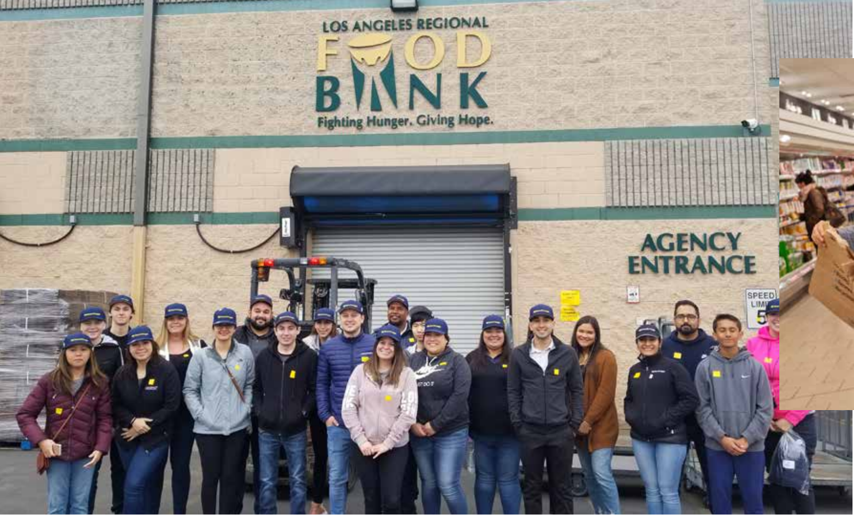
Above: Providing sustenance through food banks in California and Spain