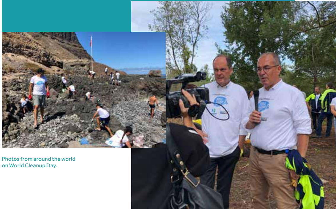
Photos from around the world on World Cleanup Day.

'It was a great opportunity to bring people together to play their part for the environment.'