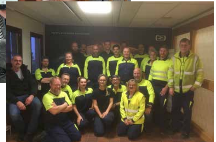
Above Right: Smurfit Kappa Brännögård employees taking part in a moustache competition to raise money for prostate cancer