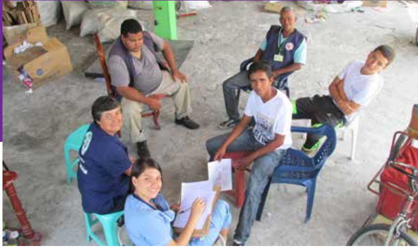
Above Left: Empowering the waste collection workforce in Colombia