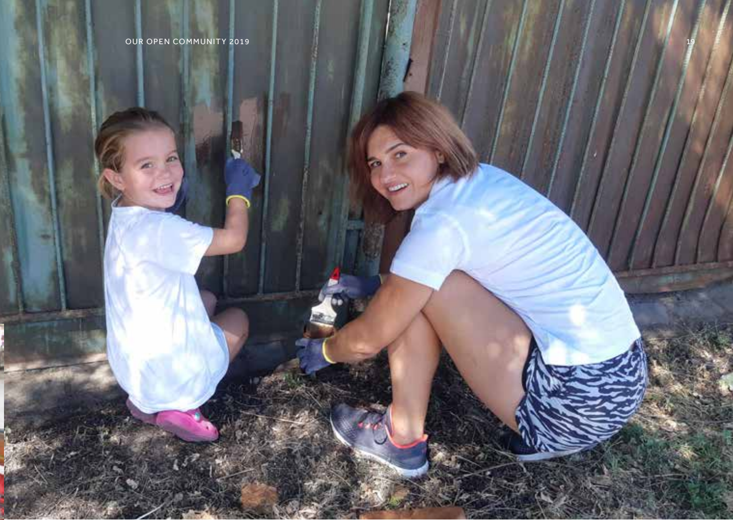
Above Right: Transforming an orphanage courtyard in Slovakia